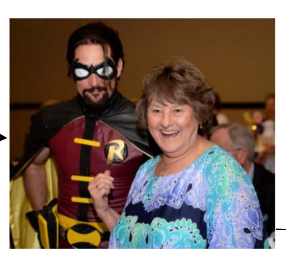
... to attending our annual luncheon