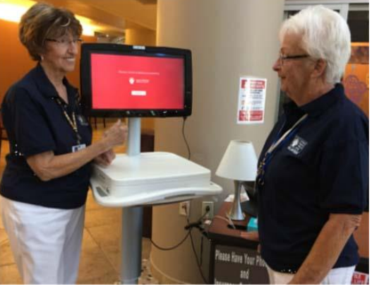
... to training