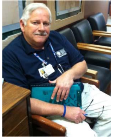
... to subbing for another volunteer