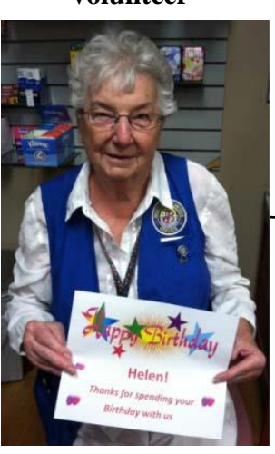
... to volunteering on your birthday