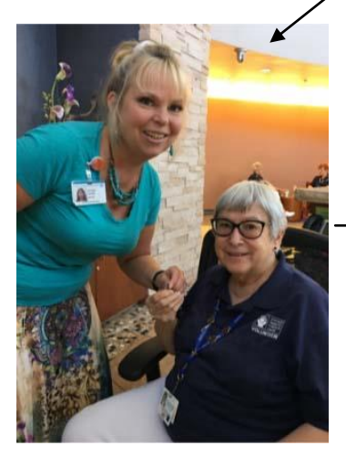
... to receiving an award pin for many hours of service (5,500 hrs.)