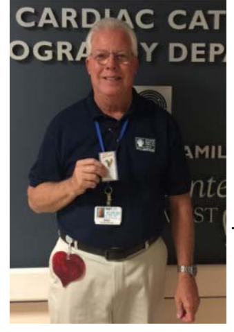
... to getting your 1st award pin (100 hrs.)

More information will be sent next month - watch your e-mails and postings at all Kiosk locations