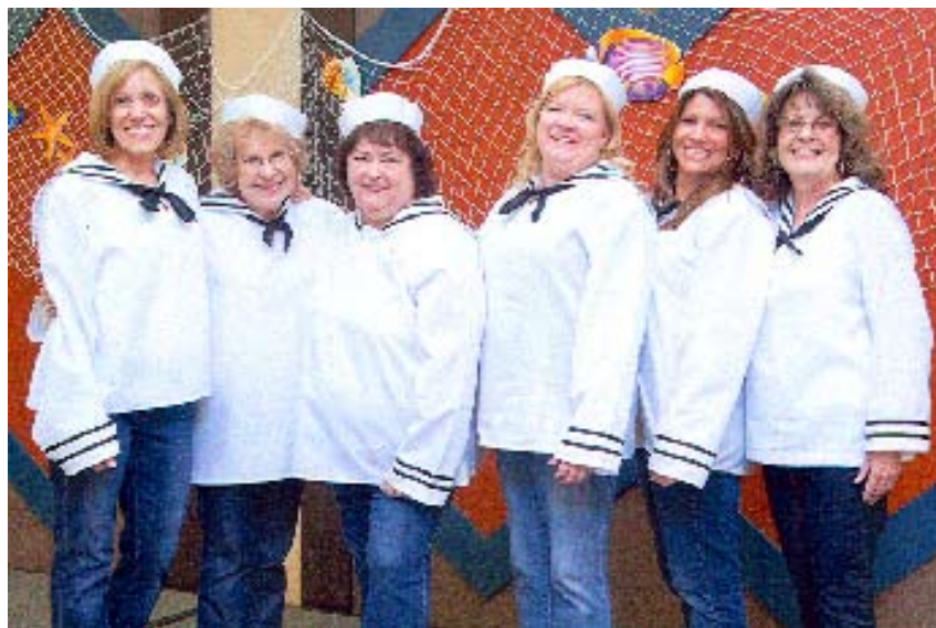
Your Volunteer Services Staff