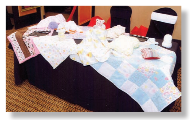
Donated Stitchery made by our Monday Club Sunshine Stitchers, Yavapine Needles, Hug-A-Bears and Individuals