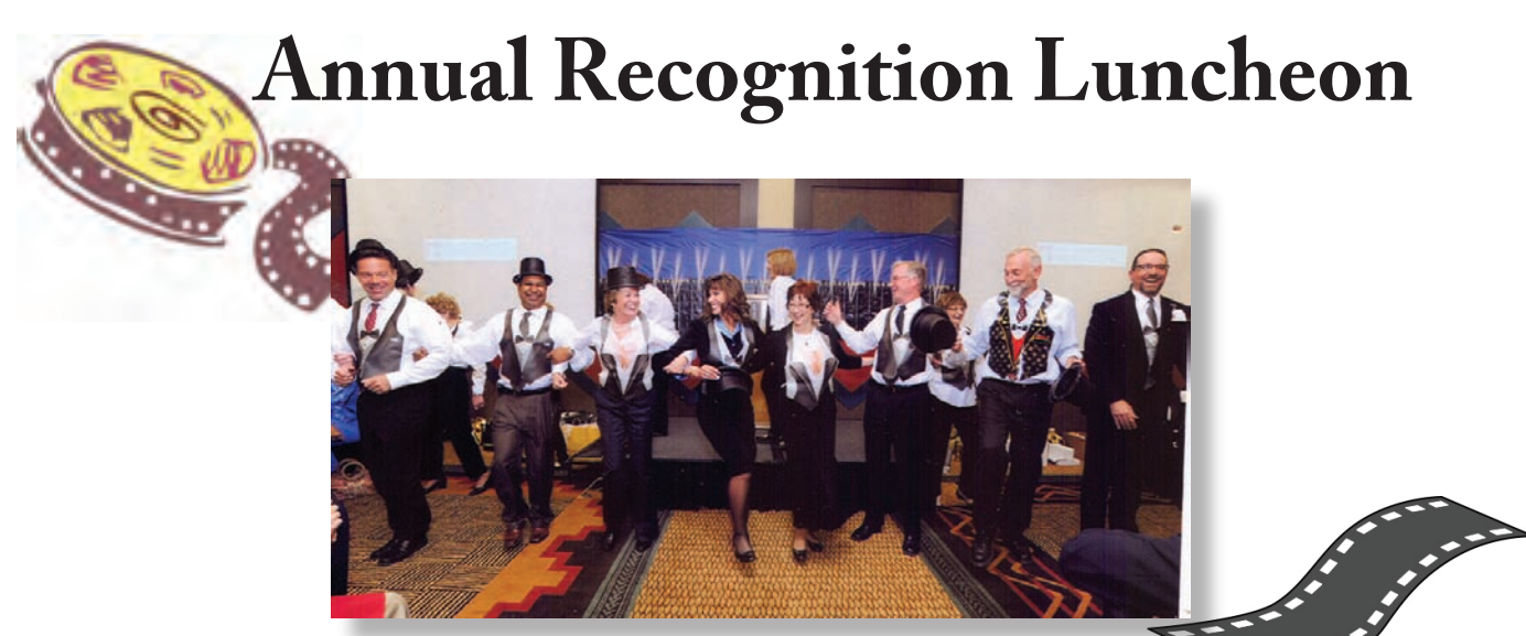
"One Singular Sensation" - ADCO members kick line