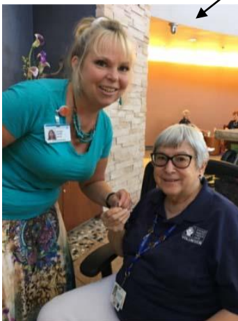
... to receiving an award pin for many hours of service (5,500 hrs.)