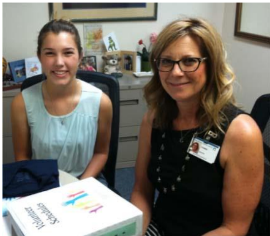
From the 1st Interview ...

Following our Volunteers throughout their Careers (Only capturing a few of the steps – we know there are more, just follow the arrows)