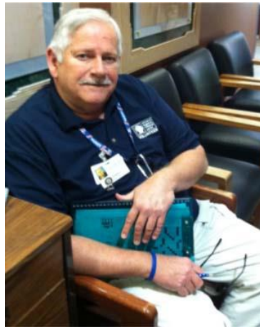
... to subbing for another volunteer