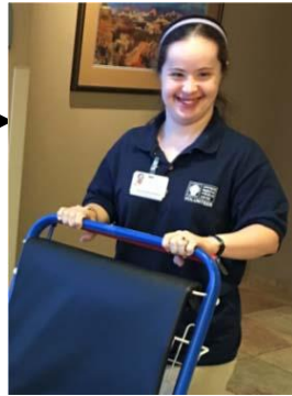
... to performing your role