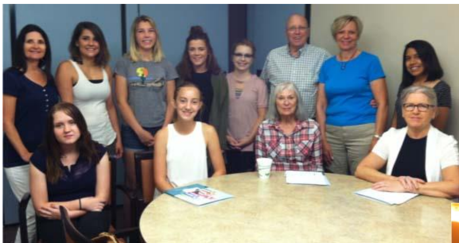
... to attending new volunteer orientation