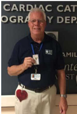
... to getting your 1st award pin (100 hrs.)

More information will be sent next month - watch your e-mails and postings at all Kiosk locations