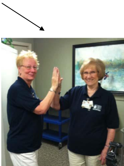
... to the shift change