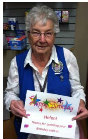
... to volunteering on your birthday