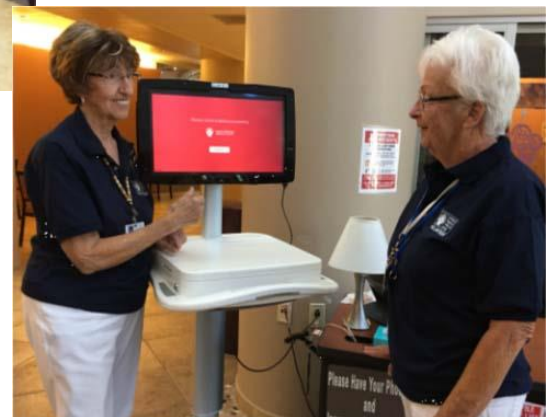
... to training