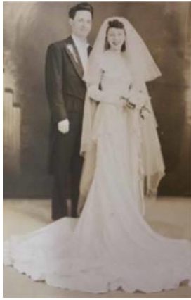
June 1, 1947