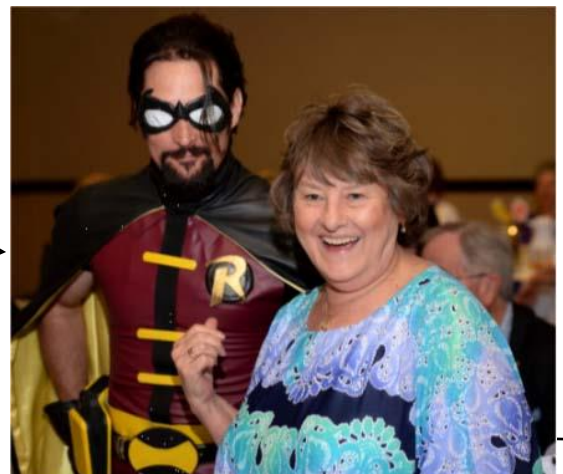
... to attending our annual luncheon