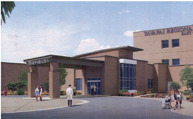
Women's Health Pavilion and Family Birthing Center at East Campus Yavapai Regional Medical Center in Prescott Valley.

The new Family Birthing Center is so big at 45,000 square feet – more than tripling the size of the 20-year-old landlocked Family Birthing Center on the West Campus! And the East Campus in Prescott Valley – where we have 38 acres of land and where the highest percentage of young