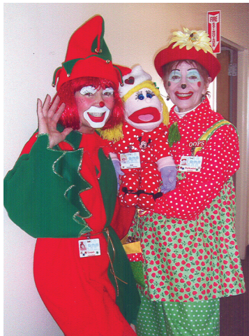
"Tinsel" (l) and "Polkadot" © with puppet Molly

Since last fall "Tinsel" and "Polkadot" have been visiting WC, and "Tinsel" visits EC, pushing their Humor Cart through the hallways, They visit the lobbies, waiting areas, and the patients where appropriate (and always checking in at the nurse's station first). Our clowns have had the same orientation and training as far as safety, infection control, HIPPA and confidentiality that all of our volunteers go through, in addition to special sensitivity training on how to use humor in an acute care setting to aid the healing process. Our clowns have also attended intensive clown school. Patty O'Patches, who began The Red Nose Caring Clowns in the Phoenix area, visits at numerous hospitals in the valley, and our clowns have shadowed her extensively so they have experience at being in the hospital environment. They also understand that not everyone is comfortable with clowns, and are careful never to push an interaction if they encounter someone that isn't comfortable with them. For those who are, numerous studies show that laughter, joy-