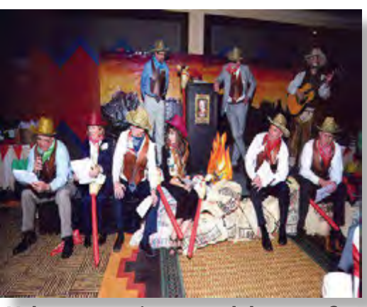
Volunteer stories around the campfire