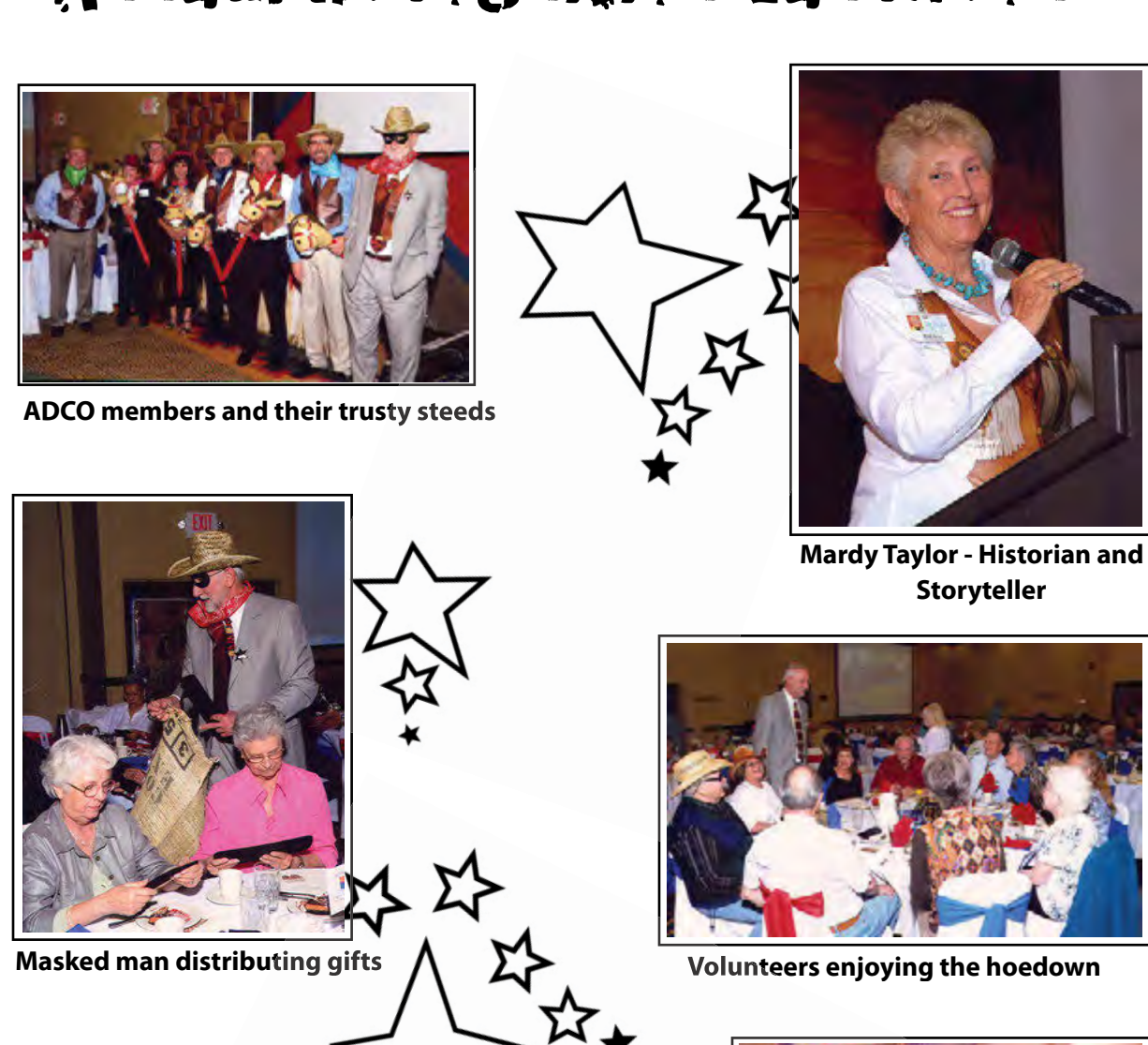
Dancin' to Ragtime Cowboy Joe