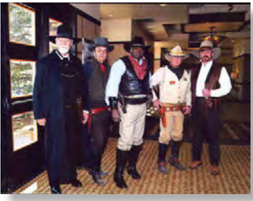
Regulators greeting us