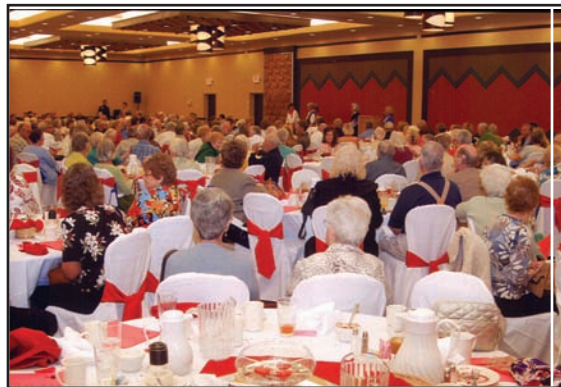
Nearly 500 strong!