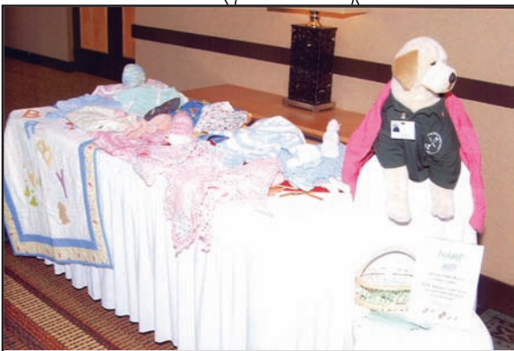
Donated Stitchery by our Monday Club Sunshine Stitchers, Yavapine Needles, Hug-A-Bears and individuals, plus PAWS mascot, who needed a name!