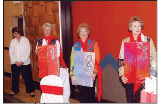
Prize Patrol - "Let's Make A Deal"