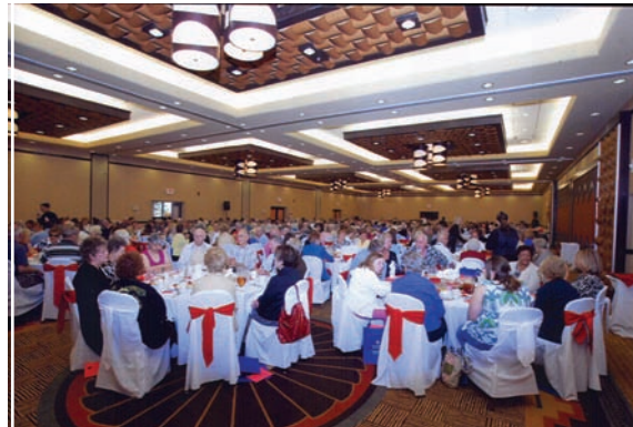
Best crowd we've ever had!