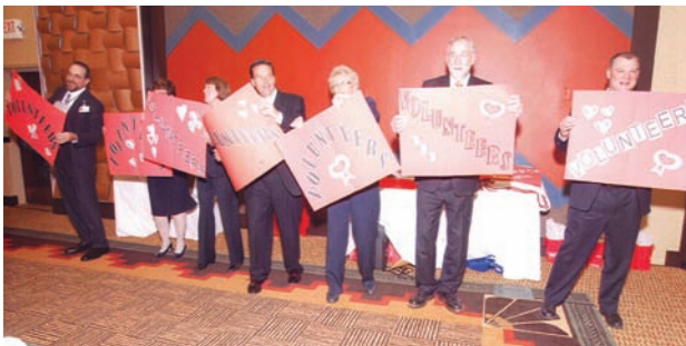
ADCO execs help with closing entertainment.

A pril is National Volunteer Month, and there were many things going on at YRMC to celebrate our wonderful volunteers! Many departments went further above and beyond than ever before in planning special recognition lunches, baked goods, parties, gifts, etc. to make their volunteers feel appreciated.