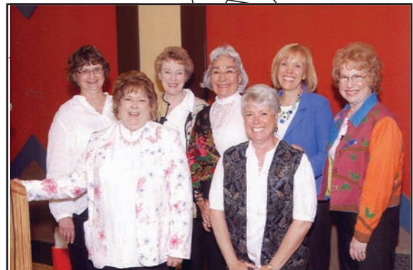
Your Volunteer Services Staff - 2009!