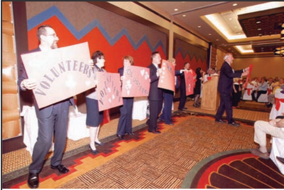
ADCO members entertain the crowd