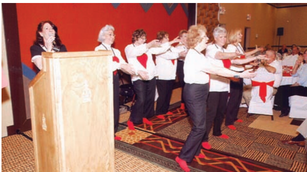
Volunteer Department staff - closing entertainment.

Capping the celebrations was our annual recognition luncheon at the Prescott Resort on April 30. We had the biggest crowd we've ever had – very close to 500 people attended. As we said at the time, it is incredible to look out over a huge room full of that many people who give of their time and talents at YRMC. It's humbling and inspiring.